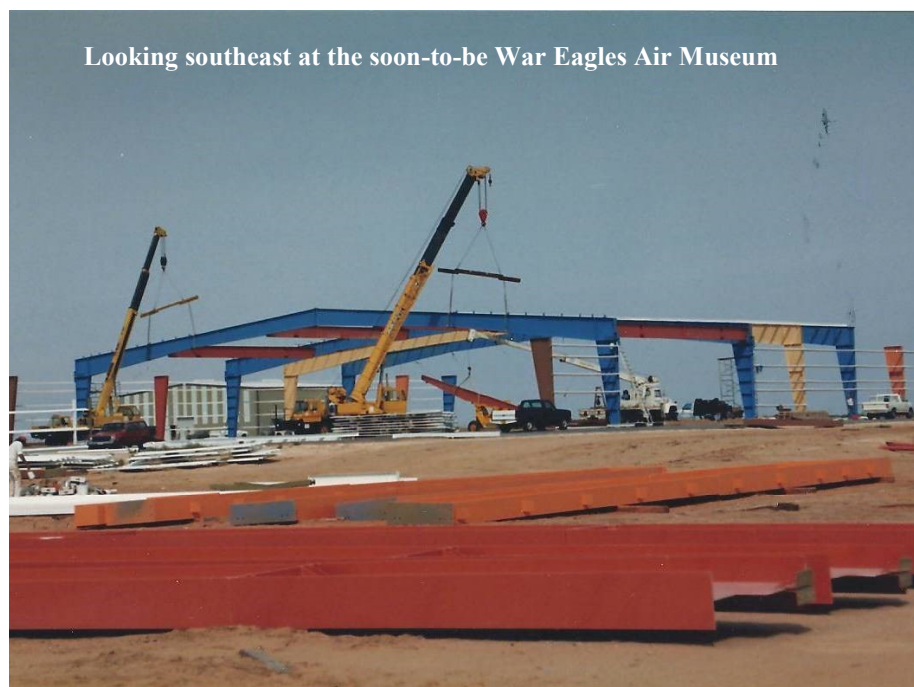
Looking southeast at the soon-to-be War Eagles Air Museum