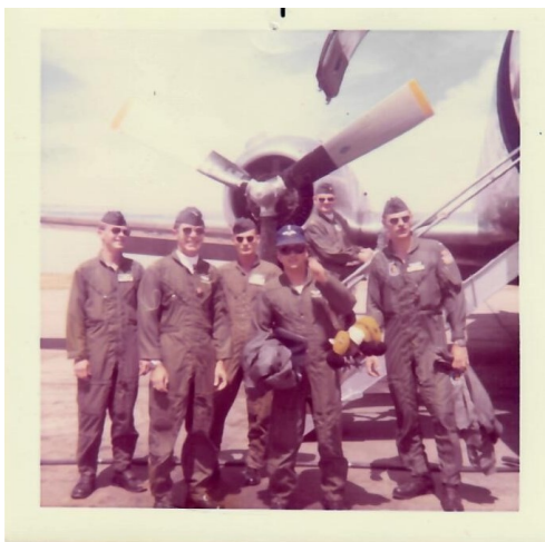
Dyess AFB Buffcrew E-17

CREW DOG OBSERVATIONS: Although the B-52 air crews were not aware of the extensive planning going on, we saw signs. We weren’t DUMB, and we knew “Somethin’ was up”. We felt it, but didn’t talk much about it. On this TDY, our Crew E-17 was at U-Tapao, and we became acutely aware of the mission stand down from December 14 th to the 18 th . Crew dogs did notice the bomb loaders were REALLY BUSY at U-Tapao and Anderson loading bombs on MANY B-52’s. Yeah, Somethin’ was really up. We were each quietly and soberly preparing ourselves for something BIG... SOON.